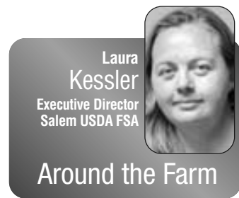
Around the Farm

There is no deadline on annual maintenance. These are the activities you perform on an annual basis to keep your contract in good condition that are not cost